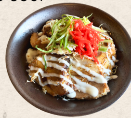
Chashu Don Braised pork belly over rice w/spicy mayo