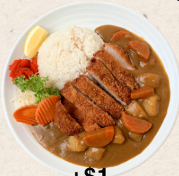
+$1 Katsu Curry Pork or Chicken Japanese curry rice w/ fried cutlet