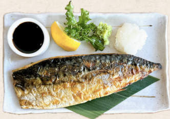
Grilled Saba Mackerel w/ Rice