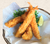
Ebi fry(2pcs) Deep fried breaded shrimp