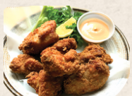
Karaage(2pcs) Boneless fried chicken