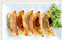
Gyoza(3pcs) Fried (Pork or Veggie) dumpling