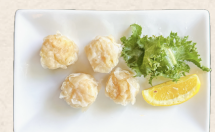
Shrimp Shumai(2pcs) Steamed shrimp dumpling