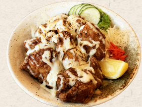
+$2 Snow Chicken Don Boneless fried chicken over rice w/ mayo & cheese

Japanese style stir-fried beef & veggies over rice