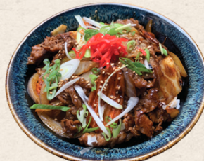
+$3 Yakiniku Don

Japanese style stir-fried beef & veggies over rice