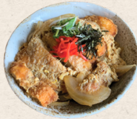
Katsu Don Pork or Chicken Simmered cutlet & egg over rice